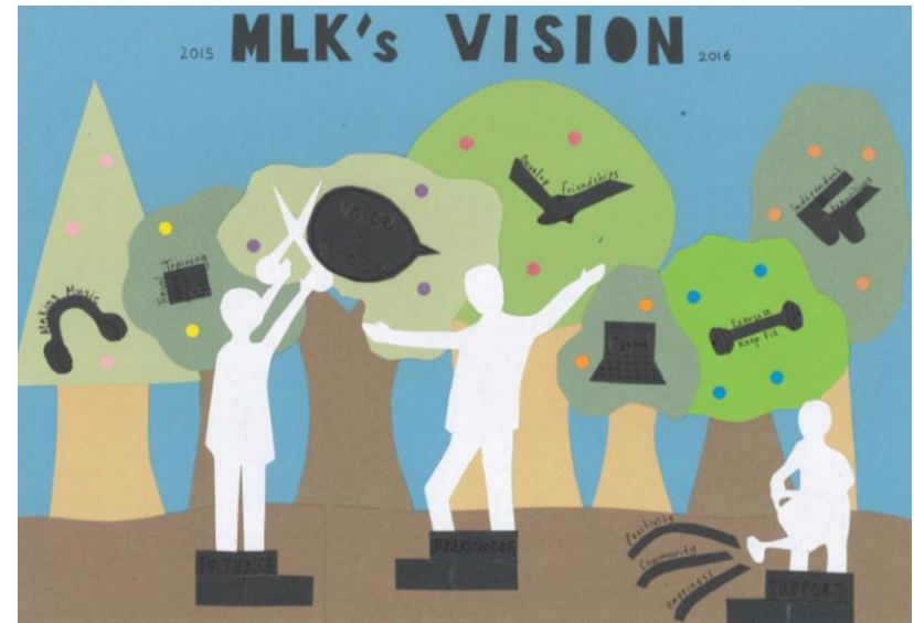
Swiss Cottage School, Martin Luther King's Class vision, October 2015, designed by the learners.

We work with mainstream and independent schools to support them understand their SEN learners better, devise strategies for coping with behavioural issues which can get in the way of learning, and coach teaching staff in the best ways to approach their learning requirements.